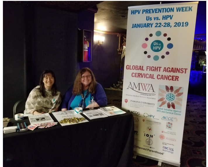
At the RAW Science Film Festival